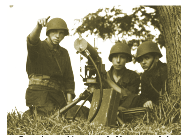
Browning machine gun, cal. .30, water-cooled

In May 1941 the U.S. Army issued rules for State Guards to comply with the minimum training standards of U.S. troops, as listed;