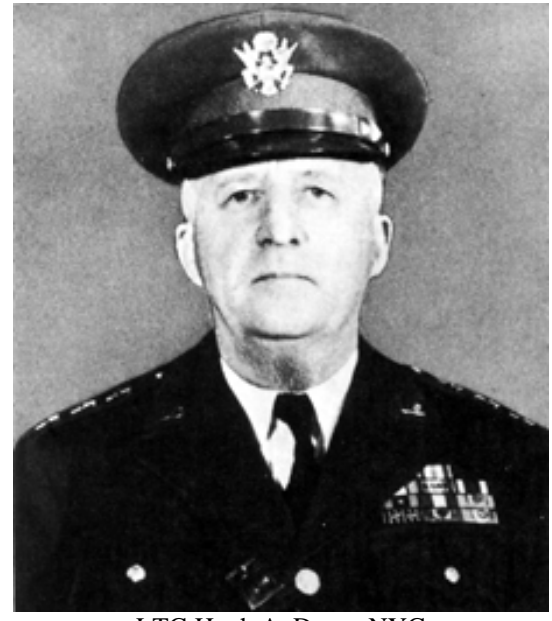
LTG Hugh A. Drum, NYG