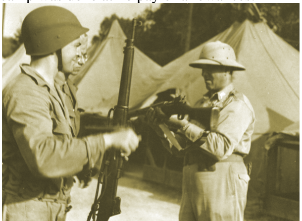
US Rifle, Cal. .30, M1917 Enfield.